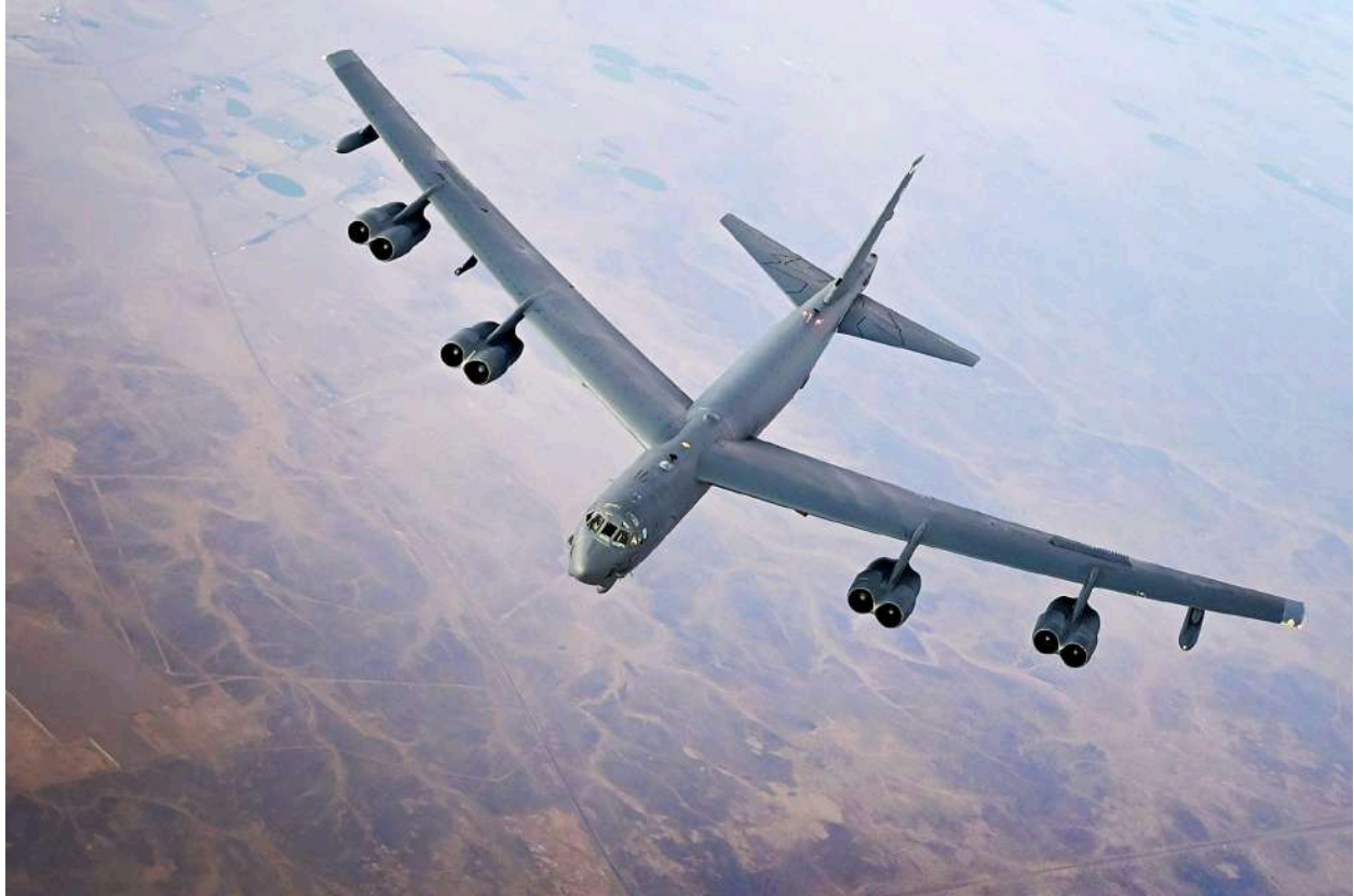
8th Air Force B-52 BUFF, Global Strike Command, 93rd Bomb Squadron Barksdale AFB, LA