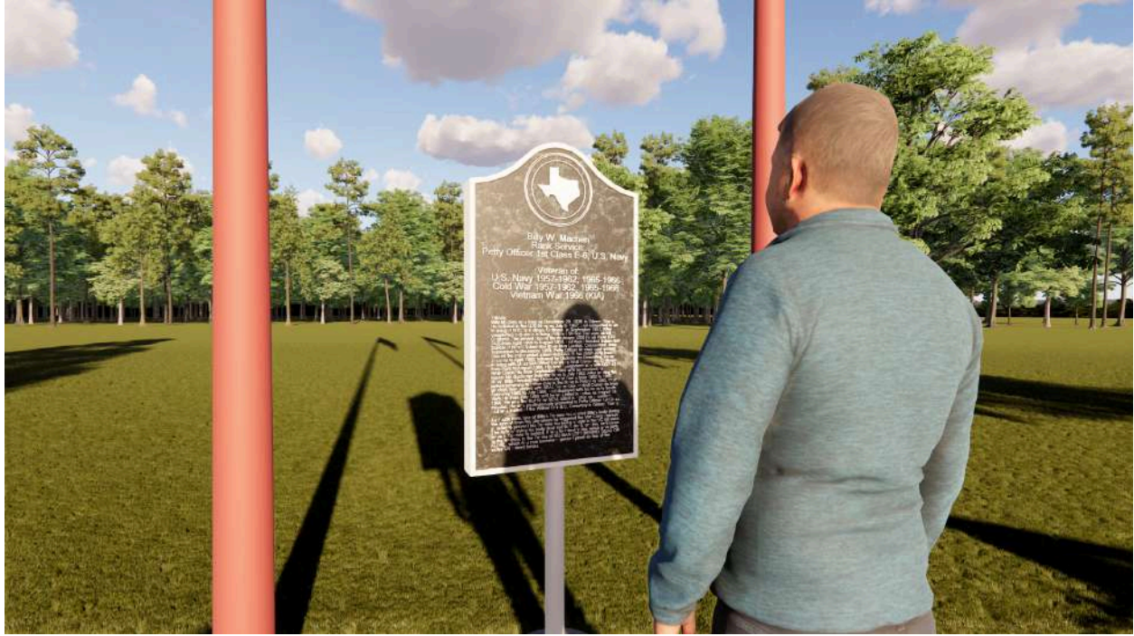
US Navy Honor Guard post the SEAL flag