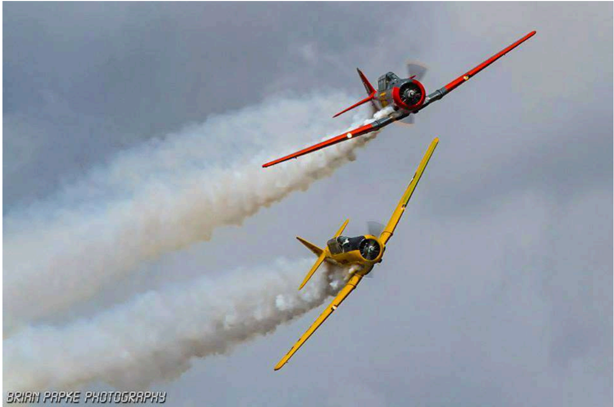
🚩 Texas Motor Speedway Video June 8 2014