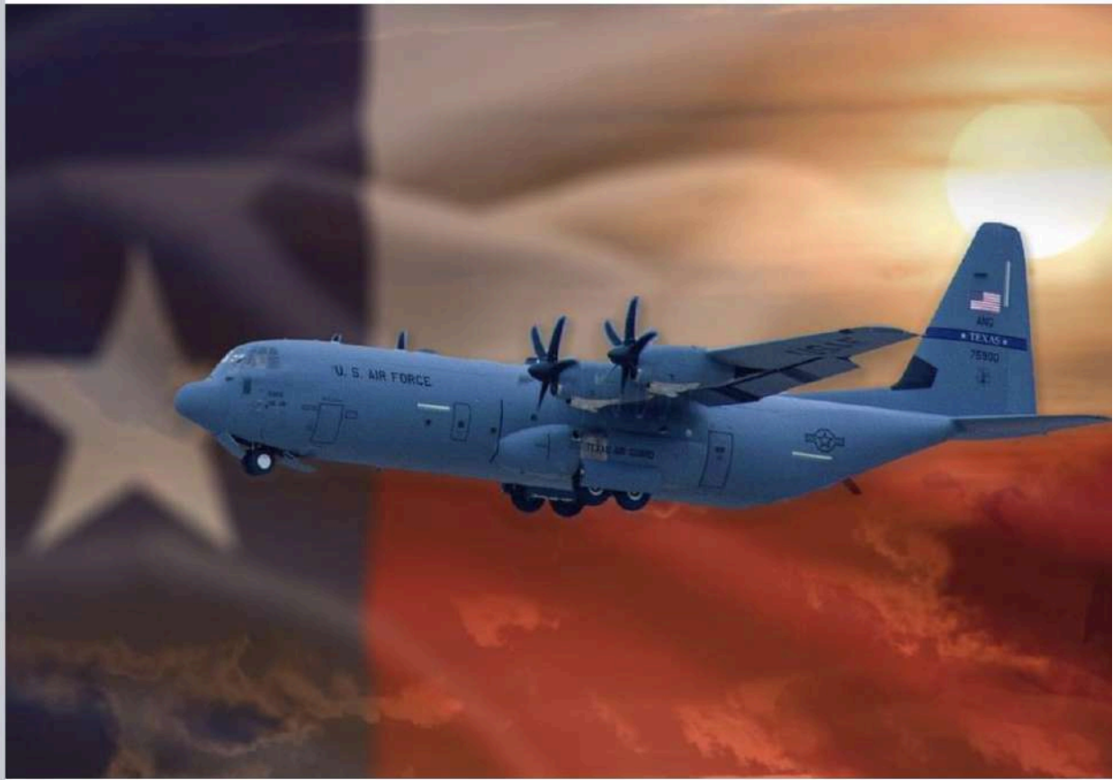
134th AIRLIFT WING TEXAS NATIONAL GUARD (invited)